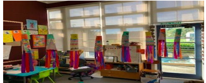
Fish carp kites in the junior room