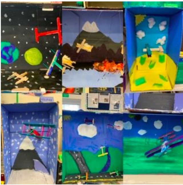
Flight dioramas- The result